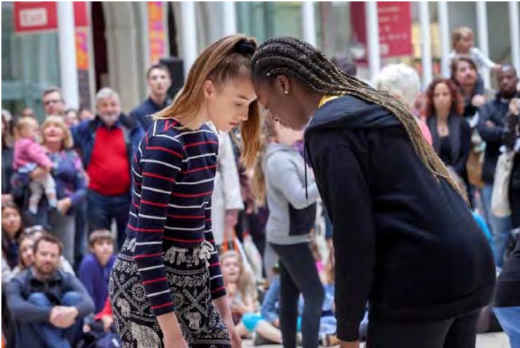
Group Hug by Tin Crate.

Partnerships were developed, including with Dance Base's PRIME over 60's dance company and Bun-sgoil Taobh na Pàirce and will lead to future joint working.