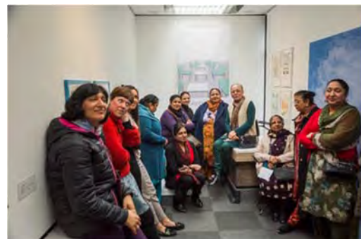
Women from Sikh Sanjog watching the film Bureaucracy of Angels by Broomberg and Chanarin inside Travelling Gallery