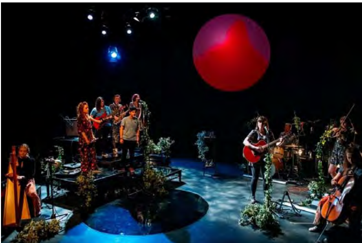
Lost in Music.

A grant of £5,000 was awarded to develop Lost in Music , a new music/theatre work aimed at a young adult audience. It explores the relationship of young people to music, and its importance to identity. It was produced by Magnetic North in partnership with North Edinburgh Arts (NEA) and had two distinct phases: