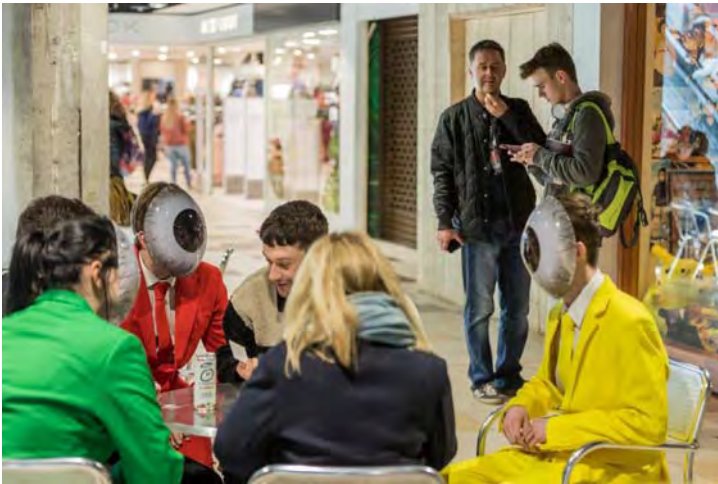
Shoplifter/Shapeshifter engagement activities Waverley Mall April 2018

Shoplifter<>Shapeshifter will also be performed at Imagineate's family day on Saturday 25 May 2019 at the National Museum of Scotland before going on to the West End Festival in Glasgow. The Company tells us: " Shoplifter<>Shapeshifter is the project that just doesn't end! It keeps growing and evolving which is brilliant.....We've had a lot of fun exploring where the piece works and where it doesn't. It's been a lot of trial and error which has been a really good learning experience for our participants "