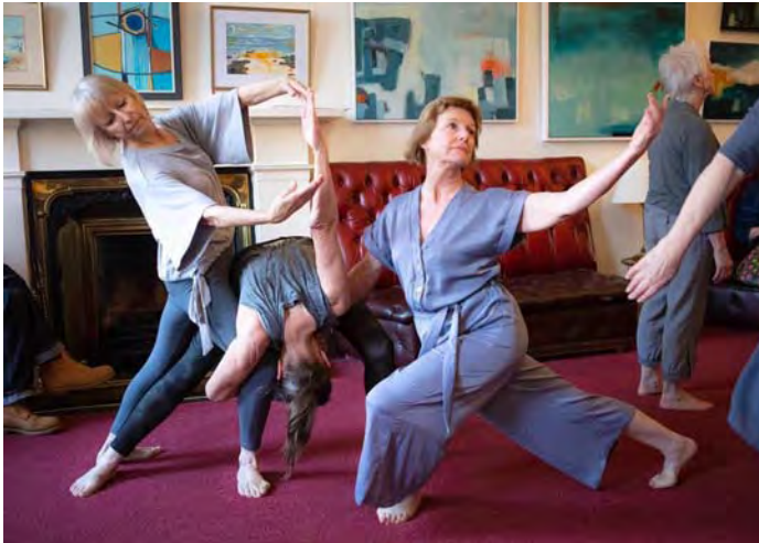
Glimpse at the Scottish Arts Club.

A grant of £5,000 was awarded to develop Glimpse – a site-specific, immersive, multi- artform and multi-generational performance in partnership with the Scottish Arts Club. Glimpse was curated by Dance Base’s artistic director to animate the Arts Club in a new and radical way. Choreographic creativity, spoken word and film was used to give insights into the past, present, and future of the building, with references to visual arts throughout with tableaux vivants from some of the great Renaissance masterpieces to text written by Edvard Munch and references to Warhol and Charles Atlas.