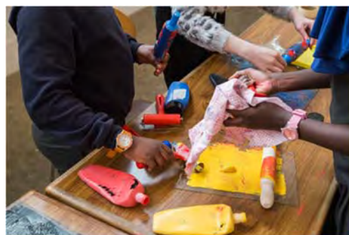
Children enjoying our printmaking workshops at WHALE Arts, Wester Hailes, Edinburgh