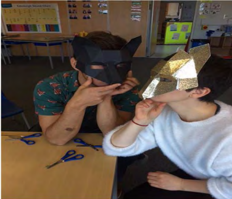
Back2School: Breakout ! at Niddrie Mill Primary School.

A grant of £5,850 was awarded to produce the 'Back2School' residency project, delivered in partnership with Niddrie Mill Primary School (Craigmillar), bringing live dance, theatre, music and art interventions into the school environment.